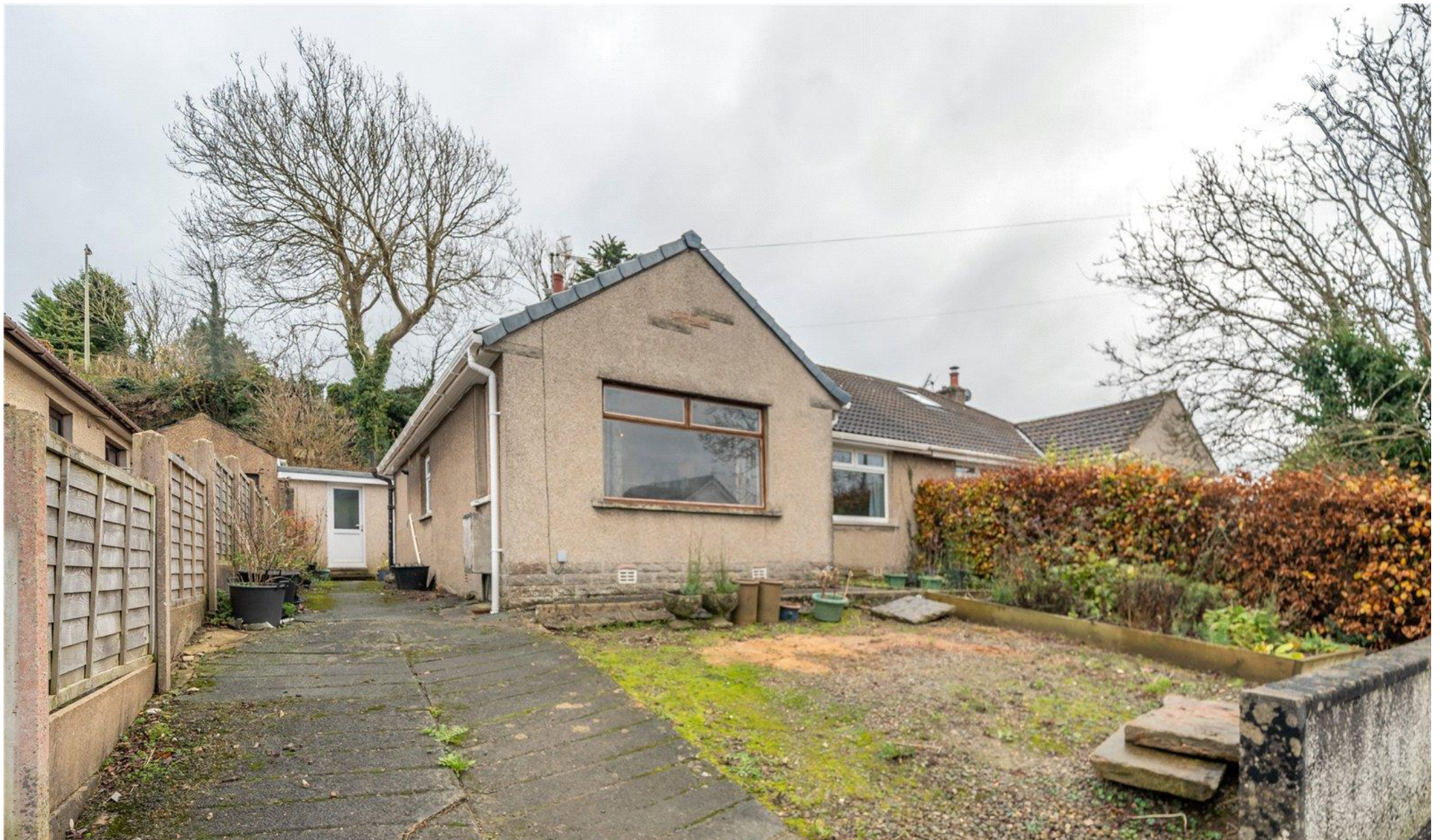
29 GREENWAYS, OVER KELLET, CARNFORTH, LANCASHIRE, LA6 1DE £260,000