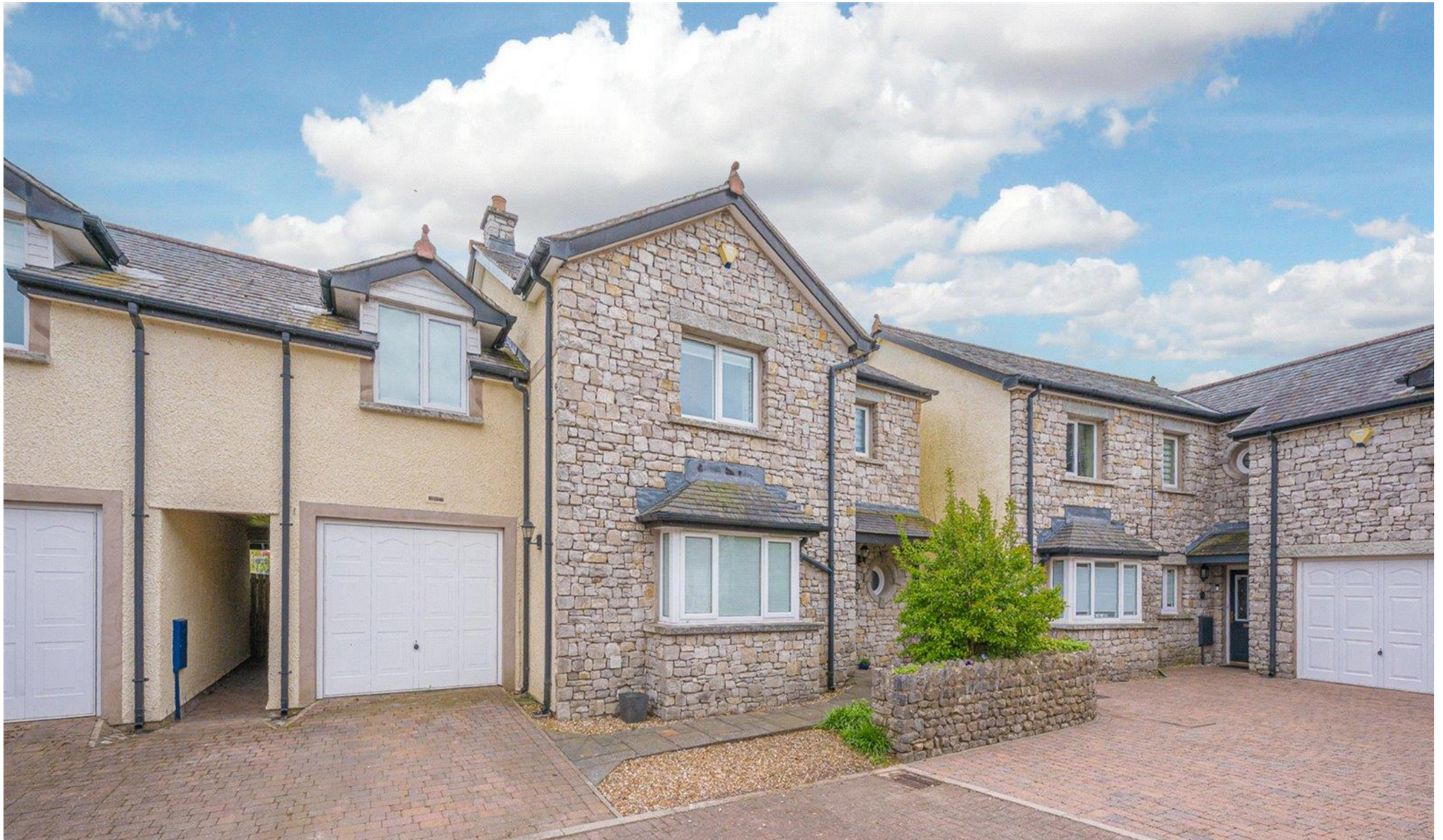
9 TOWN HEAD FOLD, HOLME, CARNFORTH, CUMBRIA, LA6 1SE £450,000