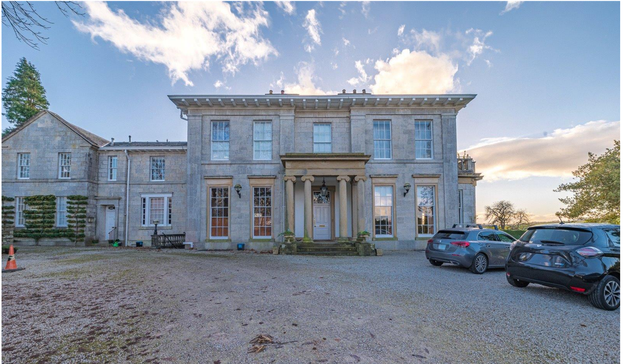
6 HELME LODGE, NATLAND, KENDAL, CUMBRIA, LA9 7QA £275,000